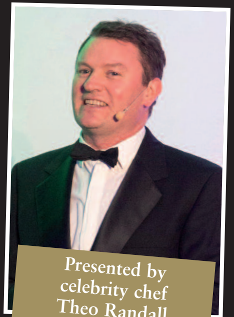
Presented by celebrity chef Theo Randall